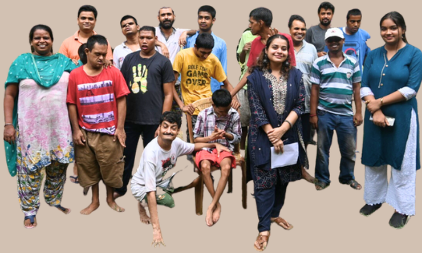
Group photo of the month