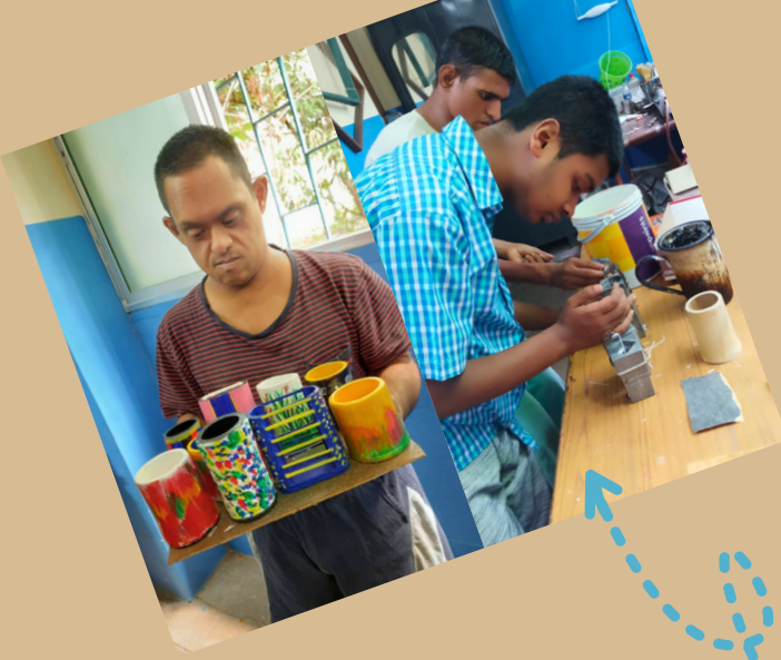
candle are being made at workshop