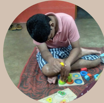
Different activities at the Daycare

Our Stall at an exhibition organized by Asansol Club received a great response.