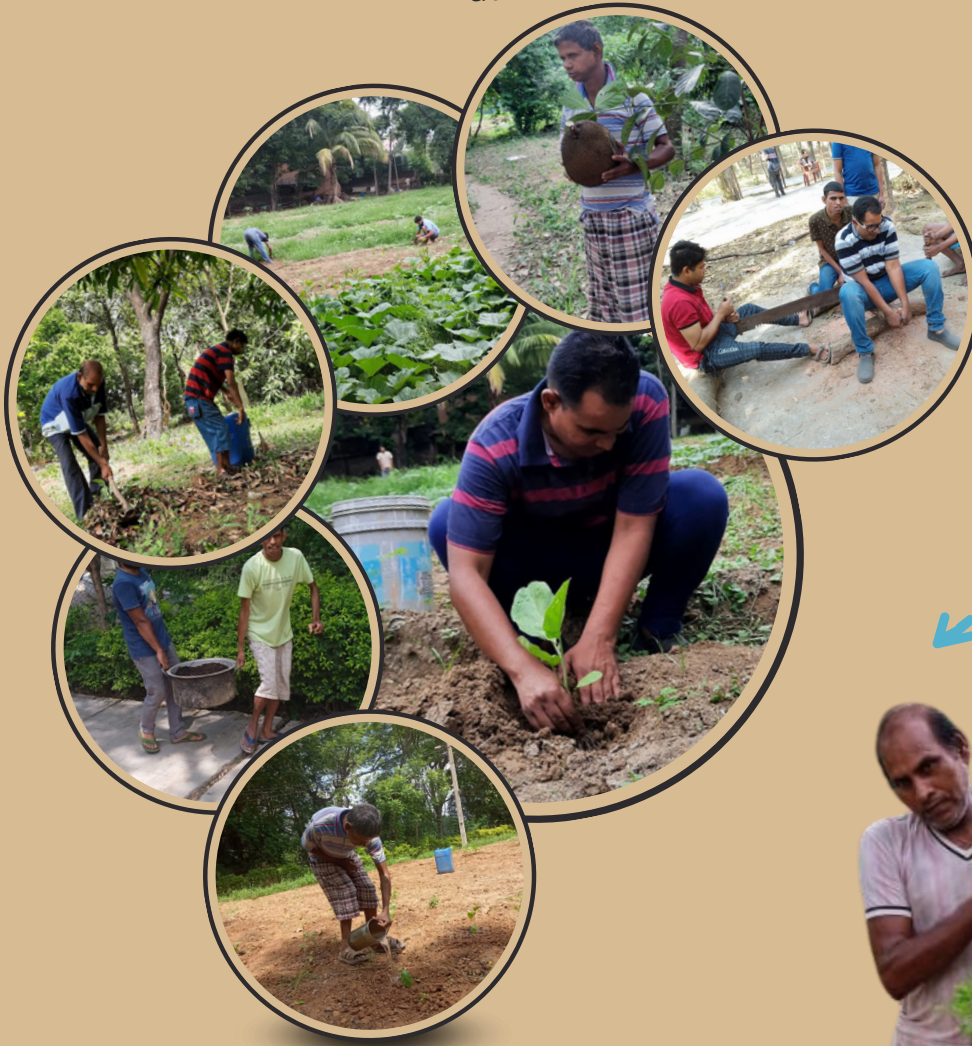
various activities at garden