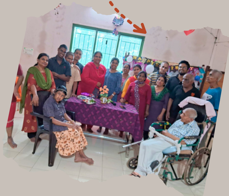
Actor Surya's Fan Team Marks His Birthday at Asha Niketan.